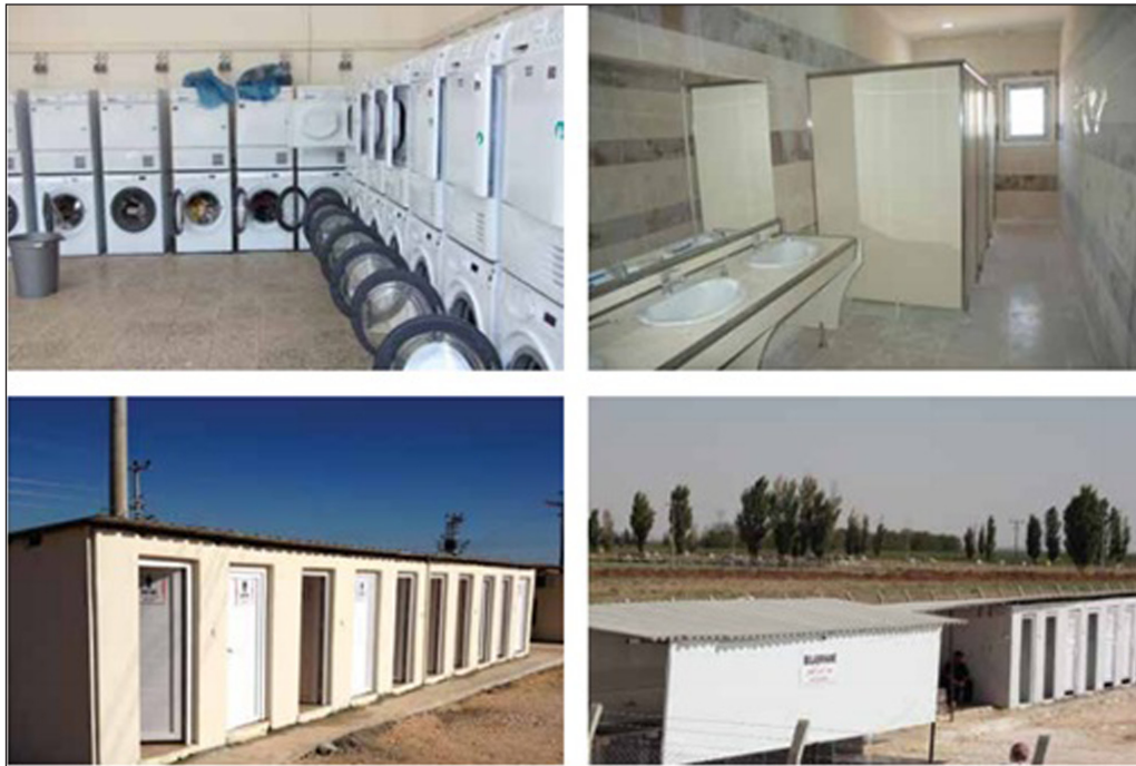
Figure 4: Refugee camps in Turkey, also include separate bathing and laundry facilities for men and women.