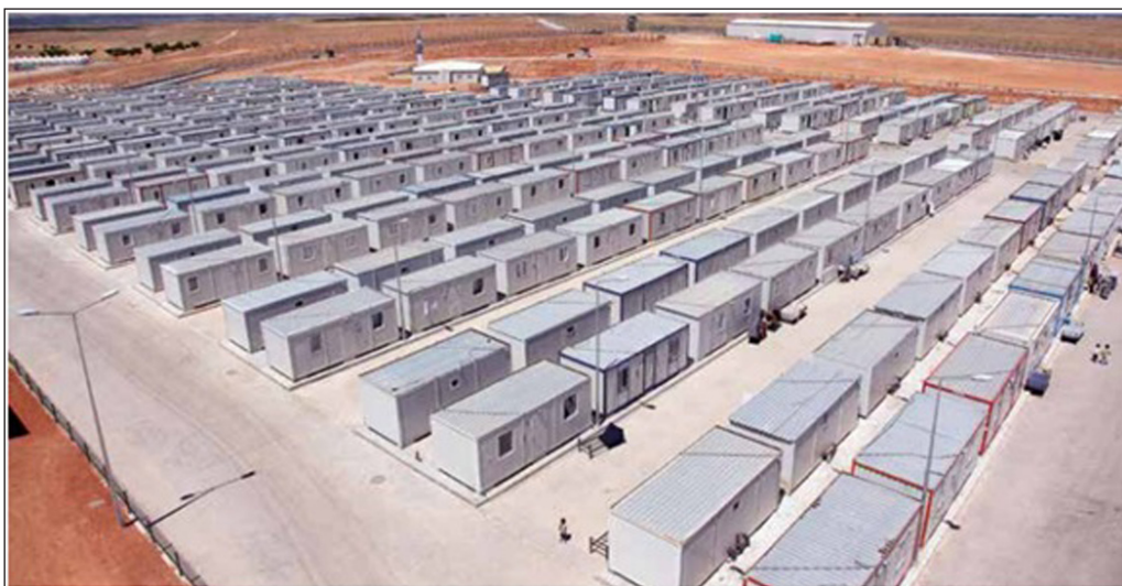
Figure 3: A typical refugee camp erected for Syrian refugees.

procedures conducted at secondary receiving hospitals and 20,443 operative cases in tertiary centers. There were also 140,968 regular and 3647 high-risk deliveries performed. Among this population, there were 4882 deaths recorded in secondary hospitals and 1396 in tertiary centers.