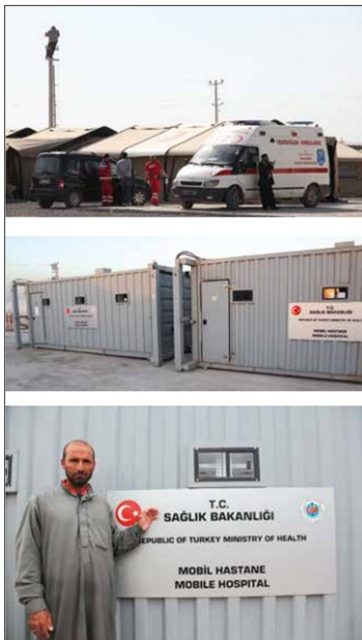
Figure 5: Camp management, security, logistics and distribution centers and mobile hospitals were located centrally within the camps.